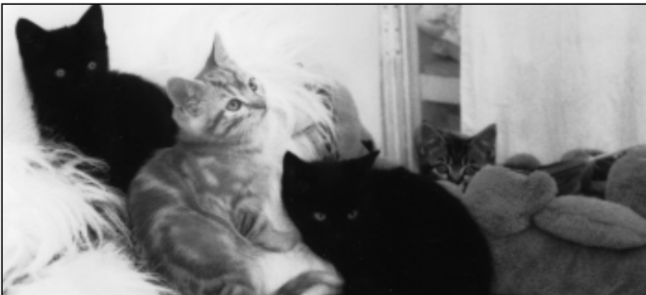
The 4 gorgeous ferrals that Valerie Wagland took time and effort to domesticate