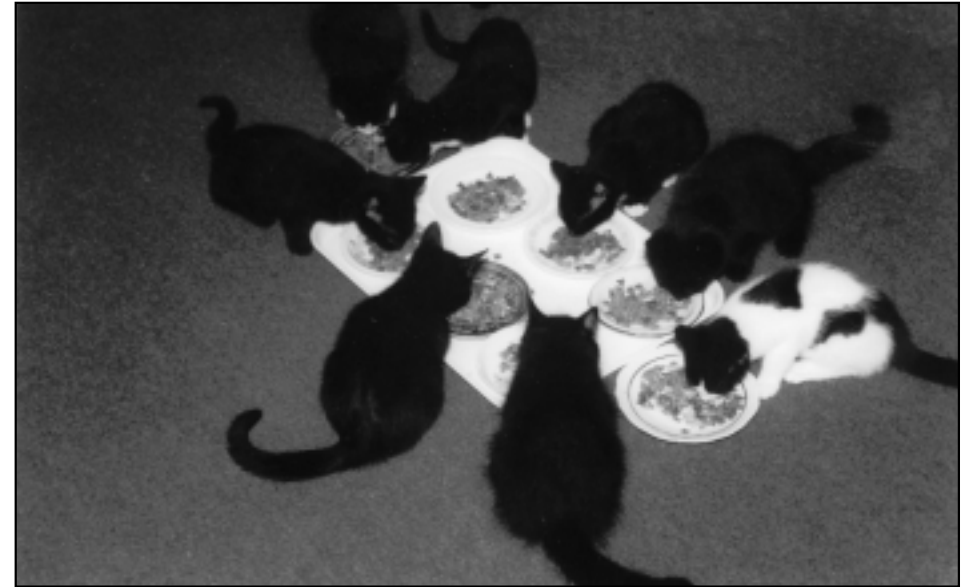
Feeding time for another group of 8 cats that homes were found for