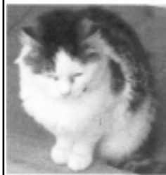
Moppett is a 7 year old very independant cat. She loves home comforts but not too much fuss.