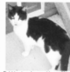
Pebbles is a 4 year old very friendly female. She is good with older children but no other cats.