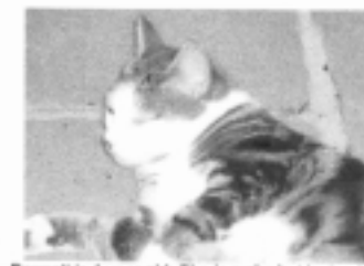
Poppett is 1 year old. She is a shy but loving little girl, neutered and microchipped. Must have a very patient owner and not other cats.